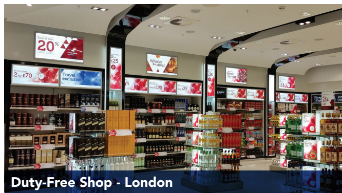
Duty-Free Shop - London