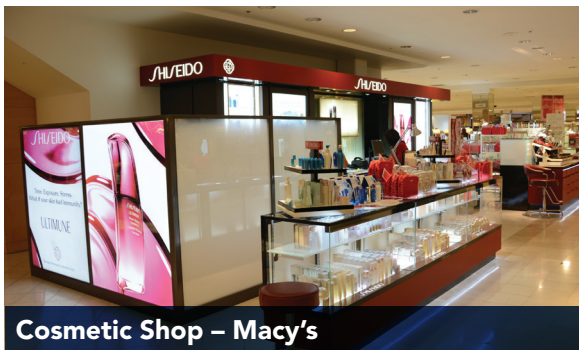
Cosmetic Shop - Macy's