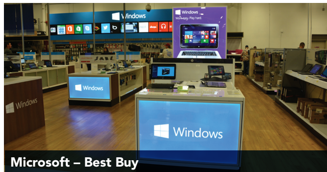
Microsoft - Best Buy