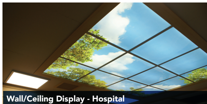
Wall/Ceiling Display - Hospital